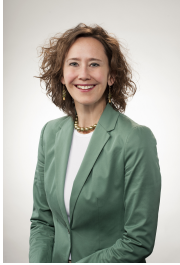
The Honourable Bronwyn Eyre