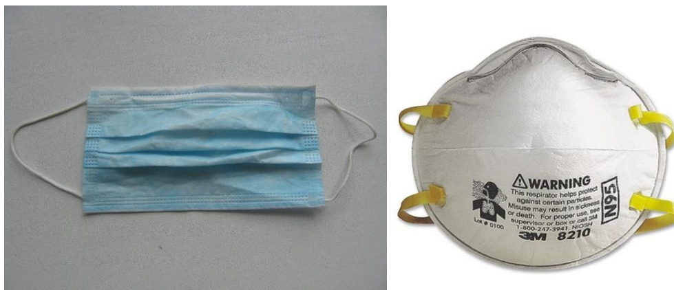
Left: Surgical/procedure mask. Right: N95 respirator