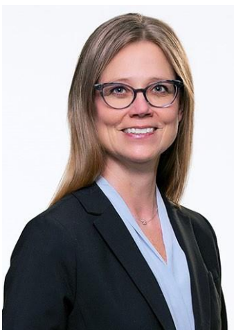
Susanna Laaksonen-Craig Deputy Minister of Energy and Resources

The Honourable Jim Reiter Minister of Energy and Resources