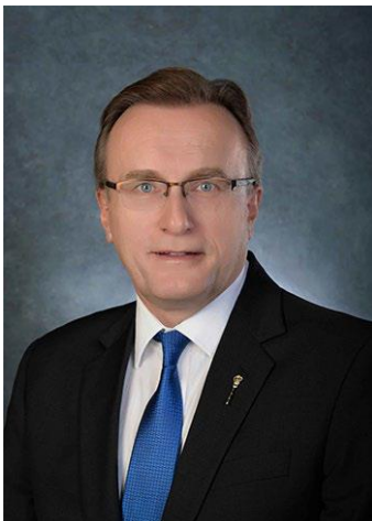
The Honourable Jim Reiter Minister of Energy and Resources

Office of the Lieutenant Governor of Saskatchewan