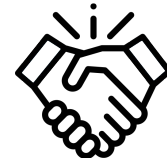
Relationship Building and Dispute Resolution