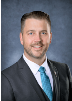
The Honourable Tim McLeod, K.C. Minister of Justice and Attorney General

As Minister of Justice and Attorney General, I am pleased to present the Saskatchewan Ministry of Justice and Attorney General's Business Plan for 2026–27. This year's plan reaffirms our commitment to a fair, accessible and effective justice system, one that protects the rights of all individuals, strengthens public safety, holds offenders accountable for their crimes, and supports the well-being of families and communities across our province.