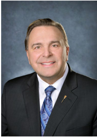
The Honourable Ken Cheveldayoff Minister of Labour Relations and Workplace Safety

I am pleased to present the Ministry of Labour Relations and Workplace Safety's 2026-27 Business Plan.