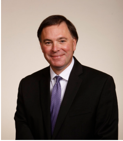
The Honourable Gordon S. Wyant, Q.C. Minister of Education

I am pleased to present the Ministry of Education Plan for 2020-21.