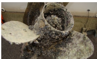
Zebra mussels on boat prop